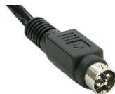
YL4 Type (KPPX-4P)