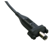
Inquire for custom design

For a comprehensive list of options, click here