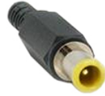
EJ1/2/3/4/5 (EIAJ RC-5320A type connectors)